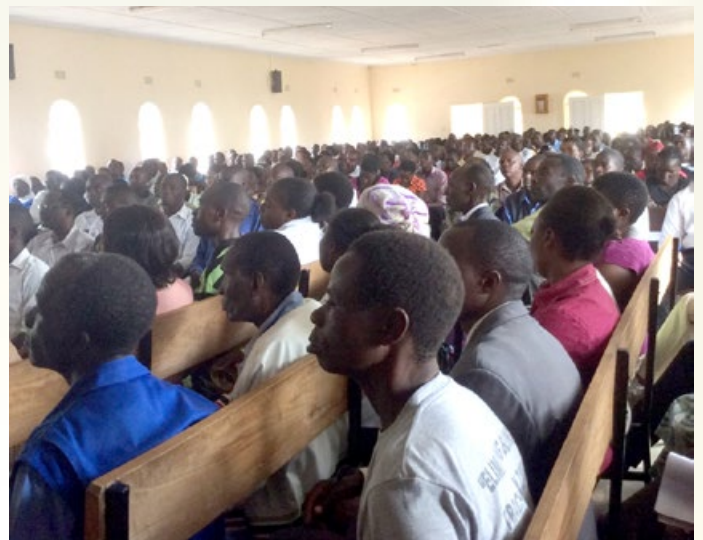
Mazabuka Seminar - 261 Certified