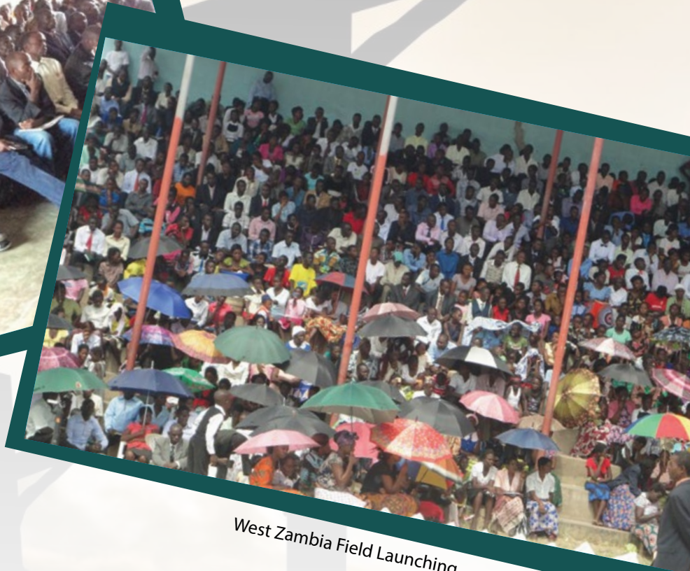
West Zambia Field Launching