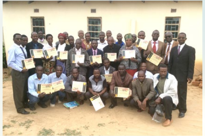
Chongwe, Lwiimba Seminar - 23 Certified

The above figure does not include the individual training done by the Conferences and Fields Directors.