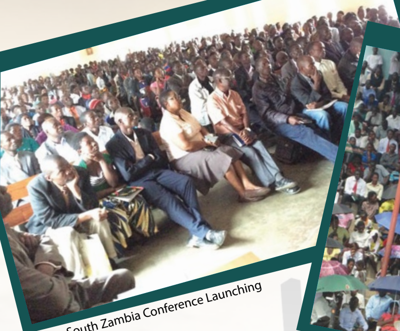
South Zambia Conference Launching