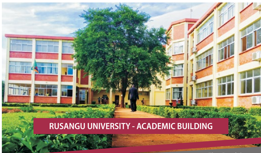
RUSANGU UNIVERSITY - ACADEMIC BUILDING